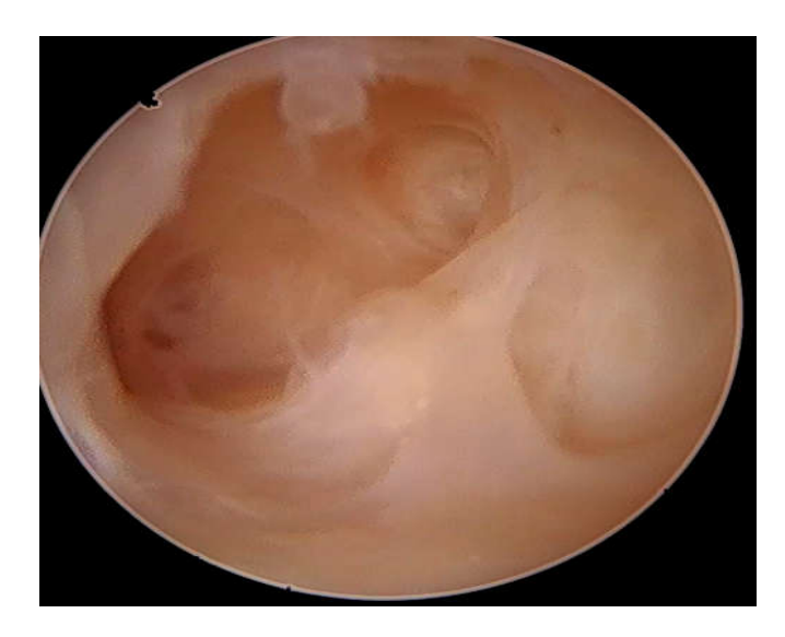
Fig. 1. Hysteroscopic picture