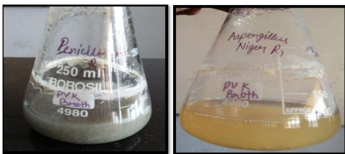
Fig. 2 Tricalcium phosphate solubilisation on PVK broth

The highest population of PSM was reported on Modified Pikovskaya (MPVK) than that of Pikovskaya (PVK) (Fig. 1). It may be due to the binding of basic dye Bromophenol blue to the genes of organisms which caused their activation for the production of enzyme phosphatase resulting in increase in P solubilisation due to acidification of media (Table 1, Table 2). Highest solubilised Tricalcium phosphates in PVK broth medium by Penicillium sp. (54.2 \mu\text{g/ml} ) followed by Aspergillus fumigatus (51.4 \mu\text{g/ml} ) and Bacillus sp. (49.4 \mu\text{g/ml} ) and least solubilised by the Aspergillus niger (11.2 \mu\text{g/ml} ) (Table 5) (Fig. 2). Majority of PSB isolates belonged to the Micrococcus and Bacillus . Majority of PSF isolates were Aspergillus niger , Aspergillus fumigatus and Penicillium . Peclzar (1993) also reported that the microorganism proliferated in rhizosphere better than anywhere else as they obtain their nutrition from root exudates, plants mucigel and root lysates.