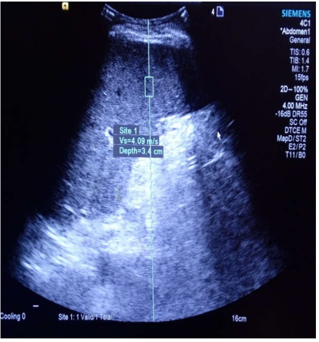
Figure 1. Spleen stiffness measured through shear wave velocity by ARFI method