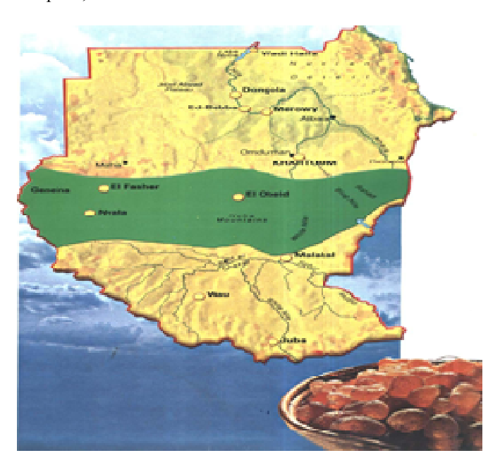
Fig. 3. The map of the gum belt areas in Sudan

activities, and then redistribute these goods to the end consumers through a network of sub-agents located in the European, American and East Asian countries.