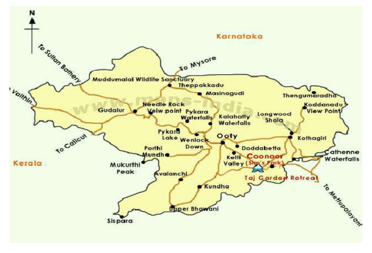
Figue 1. The Nilgiris Map

The Doodabedda is one of the highest peaks in the Nilgiris. A total of 37 bird species were had from twelve transects in the Doddabedda study area during the study period from November 2017 to October 2018 (Tables 1 & 2). The highest Encounter Rate was recorded in the house sparrow ( Passer domestics ) ER= 23.41 (LER 17.8 & UER 26.31). The lowest Encounter Rate was observed in the Eurasian black bird ( Turdus merula ) ER=0.13 (LER 0.03 & UER 0.18). The other species were noticed the moderate encounter rate of population (Tables 1 & 2). A total of 37 species it consisting of 11 orders and 27 families, were recorded. Out of 37 species, the highest Encounter Rate (ER) was for House Sparrow ( Passer domesticus ) (Figs 1 & &2).