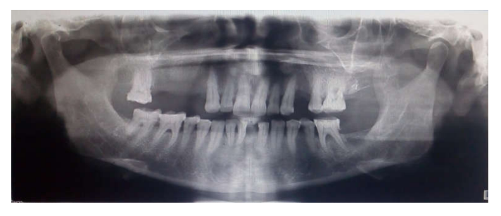
Figure 4. Reveals haziness in the maxillary sinuses on either side in the panoramic radiograph