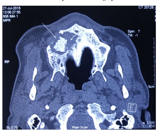
Figure 5. Axial CT shows presence of a large sequestrum on the right side of the maxillary apparatus extending up to the midline