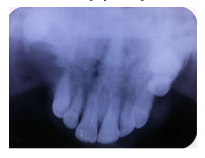
Figure 3. Is a maxillary occlusal cross sectional radiograph which reveals a diffuse radiolucency on the right side showing extensive bone destruction along with vertical bone loss in the maxillary anteriors