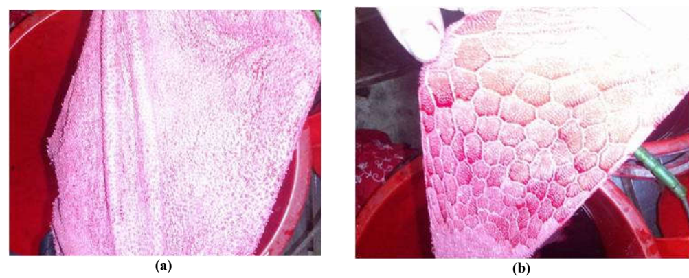
Figure 1: Dyeing of goat stomach (a) omasum part and (b) reticulum part with cherry-red colored dye