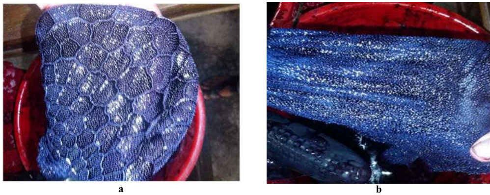
Figure 2: Dyeing of goat stomach (a) reticulum part and (b) omasum part with blue colored dye