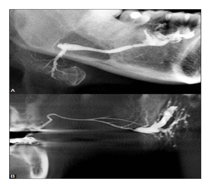
Fig. 1. Conventional sialography of submandibular (A) and parotid glands (B) showing ductal system (ref: INDIAN J RADIOL IMAGING. 2012 OCT-DEC; 22(4): 325–333.)

Sialography was introduced simultaneously and independently by BARSONY (1925), USLENGH (11925) and CARLSTEN (1926), a contrast medium of high viscosity being used (Lipiodol or iodized oil). Sialography is the retrograde injection of an iodinated contrast agent into the ductal system of a salivary gland. Sialography is a simple, painless procedure normally performed in a matter of minutes. The patient's past, present should be verified that sialography is the appropriate imaging modality. Any allergies to radiographic contrast agents, autoimmune disorders and medication, when the evaluation is being performed bilaterally salivary enlargement caused by autoimmune disorders. Fig 1