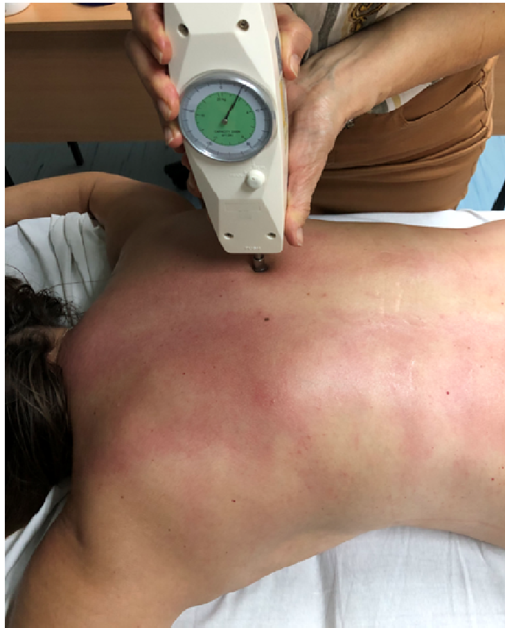
Figure 1. Algometer application