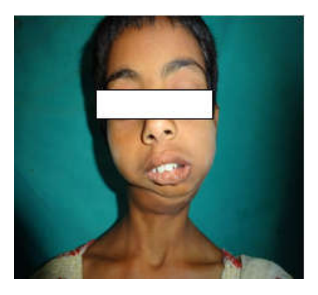
Fig.2. Shows facial asymmetry with bilateral TMJ ankylosis