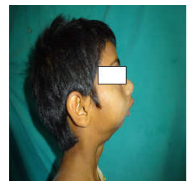
Fig. 3. Shows retrognathism