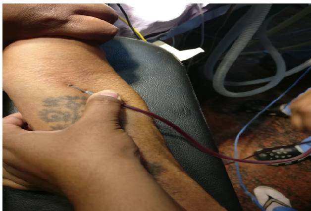
Fig. 1. Autologous transfusion procedure