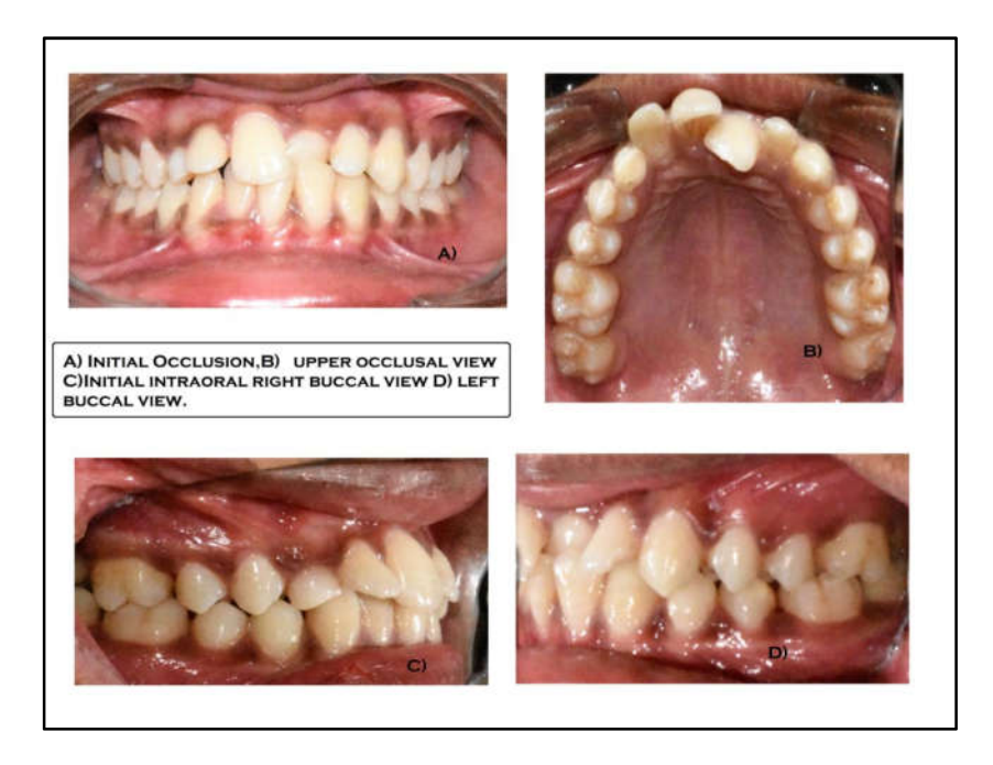
Fig.2 showing A) Initial occlusion B) upper occlusal view, C) intraoral right buccal view, D) left buccal view.