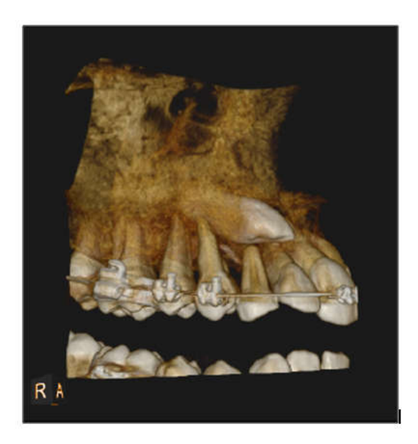
Fig.5 showing 3D reconstruction CT scan crown is placed on the labial aspect and root is placed on palatal aspect, deciduous teeth is also present.