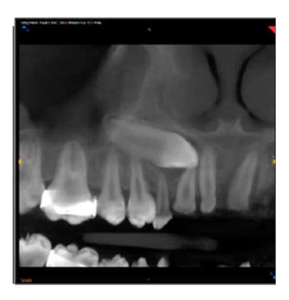
Fig.4 showing crown is enveloped with corticated well defined hypodensity i.r.t Impacted 13 on Axial CT scan.