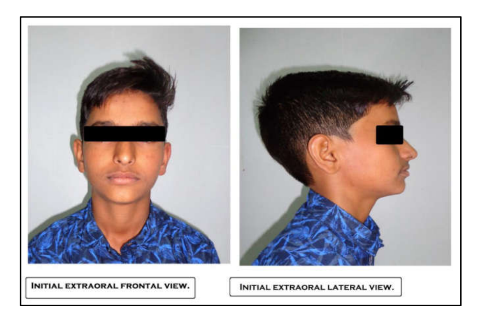
Figure 1 Clinical photographs of 14 yr old patient before treatment showing Initial extra oral frontal view & Initial extra oral lateral view.