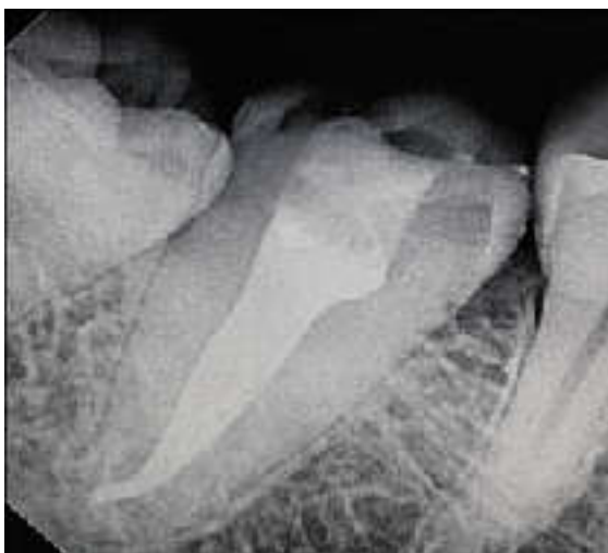
Figure 4. Radiograph showing obturation #47.

Local anesthesia was administered and access was prepared under rubber dam. A huge canal orifice was present at the middle of tooth revealing the pulp chamber. The working length was determined using apex locator and conventional radiograph, after the pulp extirpation [Fig.2]. The cleaning and shaping of the canal was done and then canal was irrigated with sodium hypochlorite 5.25%, EDTA 17% and normal saline. Master cone radiograph was taken [Fig.3]. Sterile absorbent paper points were used to dry the canal. AH plus sealer was evenly applied in the canal using lentulo spiral. Obturation was done using cold lateral compaction technique and post-endodontic restoration was done with composite resin [Fig.4].