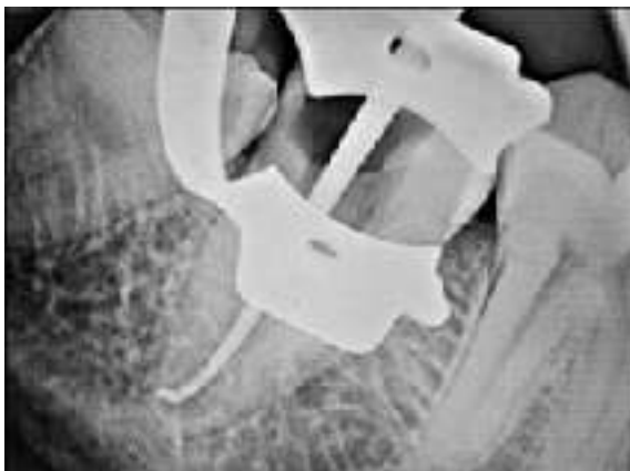
Figure 3: Radiograph of master cone #47.