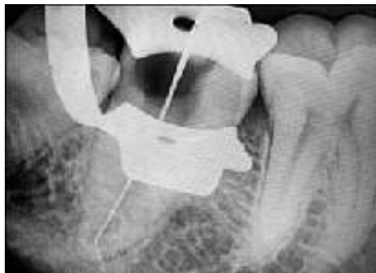
Figure 2. Radiograph of working length #47.