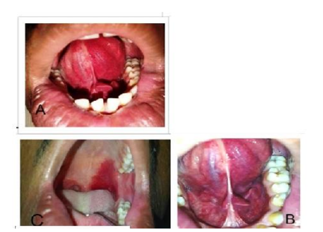
Figure 5. (A) showing diffuse swelling on left side of ventral surface of the tongue, (B) Reddish discoloration on floor of mouth, (C) Melanotic pigmentation seen over palate.