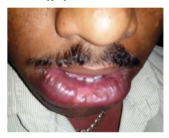
Figure 2. Everted and incompetent lower lip due to diffuse swelling