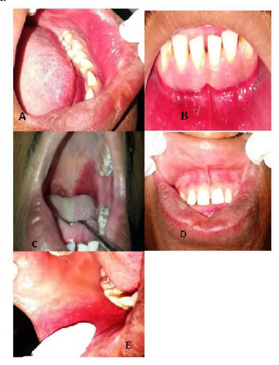
Figure 4. (A) papules on left buccal mucosa, (B) reddish papules on the lower labial mucosa, (C) reddish papules on left side of soft palate & pharyngeal mucosa, (D) papules on upper labial mucosa, (E) papules on right buccal mucosa

On intraoral examination, the hard tissue examination revealed presence of all permanent teeth. Spacing was seen between maxillary and mandibular anteriors (Figure 3). The gingivaappeared pale pink in color, with a scalloping contour, consistency was firm and resilient and there was generalized bleeding on probing of gingiva. Gingival recession was seen with maxillary anteriors. A provisional diagnosis of capillary haemangioma was made due to its clinical appearance and its growth involving the left side of face, back of the ear, neck, upper part of chest, lower lip, labial mucosa, floor of mouth, left side of soft palate, pharyngeal mucosa, ventral surface of tongue, buccal mucosa, alveolar mucosa on right & left side of mouth.