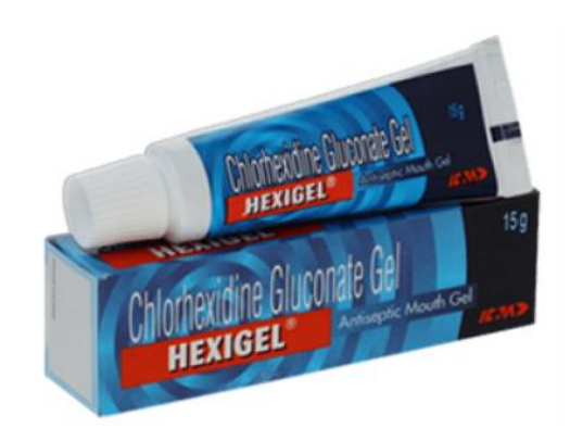
Fig 7. Chlorhexidine gel

This action will reduce the adsorption of proteins to the tooth surface, delaying the formation of the dental pellicle. Chlorhexidine molecules also coat salivary bacteria, which alter the mechanisms of adsorption of bacteria to the tooth. The main side effects of chlorhexidine are staining of the teeth and taste and the content of ethyl alcohol. The stain on the teeth can be easily removed with a pumice prophylaxis. Since chlorhexidine can temporarily affect taste sensations, use around mealtimes is not recommended. It has been recommended that high risk patients with high intraoral bacterial levels rinse 10 ml of 0.12% chlorhexidine digluconate solution once per day for 1 week every 6 months<sup>62</sup>. Since children less than 3 years of age would not be appropriate for rinsing, this would be more pertinent to mothers at high risk for caries development with high intraoral bacterial levels. Chlorhexidine is also available in gels and varnish; however, these are not currently available in the US marketplace. The gels containing chlorhexidine(Fig 7) have contained 1 or 2% chlorhexidine digluconate. The 2% gel has been shown to be effective when used as a dermatologic wound healing agent<sup>63</sup>. Gels with 1% chlorhexidine digluconate incorporated into the gel have shown efficacy in reducing caries when applied for 5 min/day over a period of 2 weeks<sup>64</sup>.