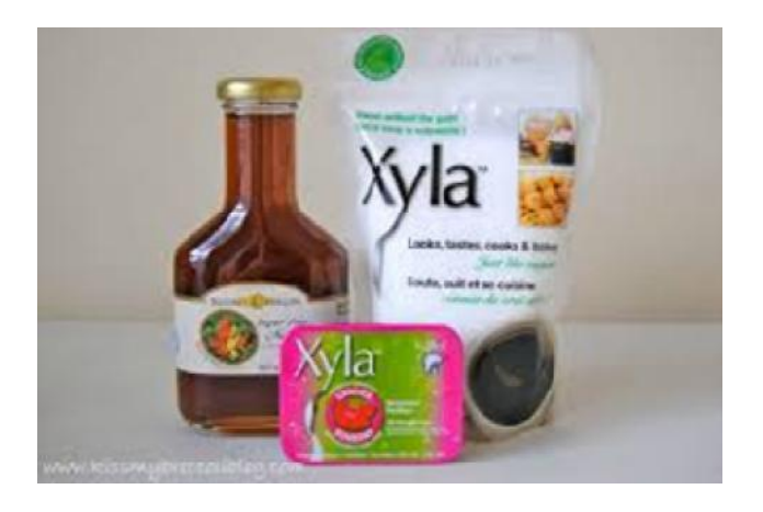
Fig 8. Various forms of Xylitol

SALIVA: Saliva is very important in providing remineralization effects for tooth structure. Since saliva is supersaturated with calcium and phosphate, which bathes the teeth, remineralization can occur with the deposition of minerals into subsurface enamel lesions. Saliva is also important as a buffering agent. This is critical to control the pH of the oral environment. Buffering can be attributed, in part, to bicarbonate in stimulated salivary secretions and peptides, as well as amino acids in unstimulated saliva<sup>77</sup>. Furthermore, salivary proteins aid in antimicrobial activity by inhibiting bacterial growth<sup>78</sup>. Examples of these proteins would include histatins, lactoferrin, peroxidase, and lysozyme. An adequate salivary flow rate is considered to be approximately 1 ml/min. If salivary flow is reduced to less than 0.5 ml/min, interventions should be considered.