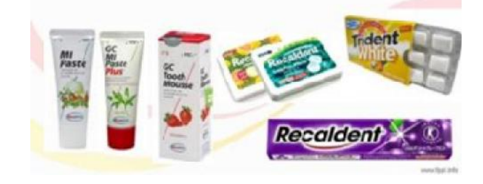
Fig 10. Various forms of CPP-ACP

Other CPP–ACP carriers: CPP–ACP has also been incorporated into dental sealants and dental varnishes. A slow release of the calcium and phosphate would seem to be beneficial; however, little research is presently available for these carriers of CPP–ACP, and further information should become available in the near future.