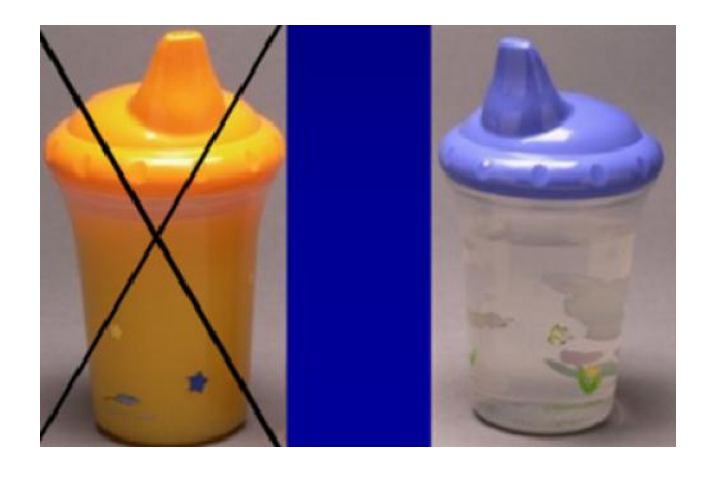
Fig. 4. Sippy cup with plain water an alternative to break the habit

DIET AND NUTRITION CONSIDERATION OF PRETHREE CHILD: Bottle feeding ad lib and nocturnally continues to occur with frequency and has been documented in a large number of working families well into the third year of life<sup>48</sup>, so in the 3 year AG paradigm, entry at any age demands the dentist ask about the bottle. Clinicians can no longer assume that simple admonition about the risk of nocturnal bottle use will result in behaviour change. The pressures of work, single parenting, and caretaking multiple children may make ad lib and nocturnal bottle or sippy cup feeding a convenient behaviour modification tool for parents. Reasonable and workable alternatives need to be offered to families to break the habit (Fig 4).