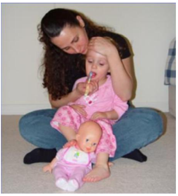
Fig 5, 6. Application of oral hygiene to prethree child

Flossing may introduce an additional unnecessary and burdensome step that has little support from evidence as to its anticaries benefit<sup>40</sup> In providing AG to parents for oral hygiene procedures, it is important to demonstrate application of dentifrice, a full "round" of tooth cleaning, and positioning. Do not assume that a parent can effect plaque removal without some instruction. Critical to a successful home hygiene program is its integration into the lifestyle of the family. Considerations must include location, timing, selection of devices and their expense, positioning, and problem solving relative to other needs of the child<sup>40</sup>.