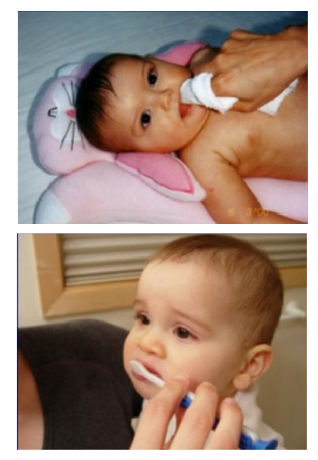
Fig 1, 2 Oral hygiene maintenance of child by the mother/caretaker

CHANGING ADVICE FOR CHANGING CHILD: This section describe the content of the six areas of Anticipatory