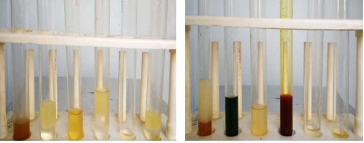
Figure 5.1A Results showing the phytochemical screening of Aqueous Seed extract of Azadirachta indica