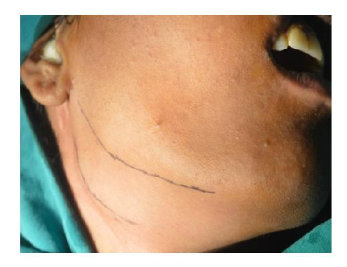
Fig 3. Submandibular incision marking

On the basis of history, clinical, radiographic examination, a diagnosis of right submandibular calculi was made. Blood and serum biochemistry findings were within normal limits and her health history was unremarkable. Under general anesthesia, folloing all aseptic precautions, submandibular incisio was marked, running 2 cm below the inferior border of the mandible, firm incision made with a no. 15 blade in a single stroke, blunt dissection was carried out (Fig 3 submandibular incision) in layers. Submandibular gland and facial artery were identified (Fig 4 submadinular gland & facial artery identified), facial artery was carefully isolated from the gland and ligated. Removal of stone was very difficult as the gland was fully inflammed, stone was located in the center of the gland and it as smaller in size. Removal of the sailolith along with submandibular gland was performed (Fig 5 sailolith along with submandibular gland). Closure was done in layers with 3-0 vicryl and silk sutures. The postoperative period was uneventful and patient was put on to NASIDS, antibiotics therapy besides a warm saline rinse for couple of days. There were no remarkable post operative complications as the surgery was instituted by taking care of adjacent vital structures.