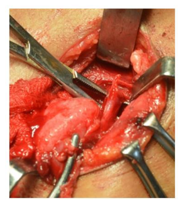
Fig 4. Submandibular gland & facial artery identified