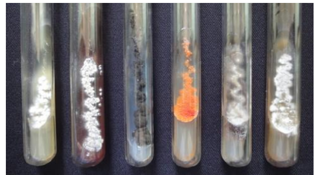
Plate 2. Pure culture on PDA slants