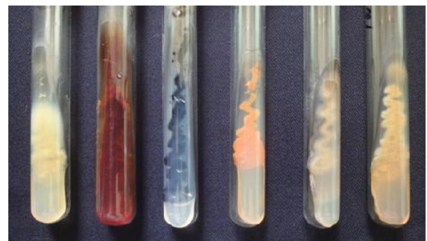
Reverse side of the Pure culture on PDA slants

The ability of the antagonist to tolerate and grow in the presence of a fungicide and an insecticide was also tested in broth culture. (Bernan 2004., Cragg.2013 The antagonist not only tolerated fungicide concentration ranging from 10 \mu\text{g}/\text{ml} to 60 \mu\text{g}/\text{ml} but also grew well in all the concentrations tested. It was also observed that growth was more in higher concentrations than in lower concentrations. Similar growth trend was noticed in tubes amended with the insecticide monocrotophos at the rate of 10 \mu\text{g}/\text{ml} to 60 \mu\text{g}/\text{ml} . Here again growth was more in higher concentrations than in lower concentrations.