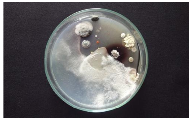
Plate 1. Isolation of marine actinomycetes on SCA

Among the five fungi tested Fusarium solani was totally resistant to the antagonist. Fusarium solani was the least sensitive with 14% inhibition. Out of the five remaining fungi Rhizoctonia solani was found to be highly susceptible to the antagonist with 75% growth suppression followed by Drechslera oryzae (40%), Colletotrichum gloeosporioides (23%) and Curvularia lunata (23%). (Plate- 3). Culture filtrate at 10% concentration reduced radial growth by 51%. When a sub-lethal dose of 2 \mu\text{g}/\text{ml} was integrated with 10% CF completely inhibited mycelial growth (100%). In another experiment growth of the biocontrol agent Trichoderma harzianum on PDA poisoned with 10% CF alone and in combination with the fungicide carbendazim at the rate of 2 \mu\text{g}/\text{ml} was tested. (Athoor. 2002 and Bardy. 2005).The CF had no adverse effect on the growth of the biocontrol agent but integration of CF (10%) with fungicide (2 \mu\text{g}/\text{ml} ) completely arrested mycelial growth. However, Trichoderma grew after 7 days and the colony remained white and no sporulation was noticed till 15 th day. The same combination was tested for its effect on sclerotial germination too. The culture filtrate had no inhibitory effect on sclerotial germination. But the hyphal extension was slower on CF (10%) amended plates than in control plates. But integration of the fungicide at the above concentration completely inhibited sclerotial germination.