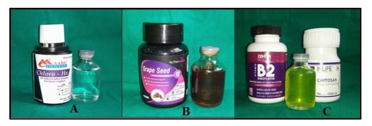
Figure 1. A. 2% Chlorhexidine, B. 6.5% Grape seed extract, C. 1% Riboflavin/Chitosan