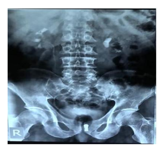
Fig. 1. Non excretion of contrast from left kidney with normal excretion from right kidney on IVU