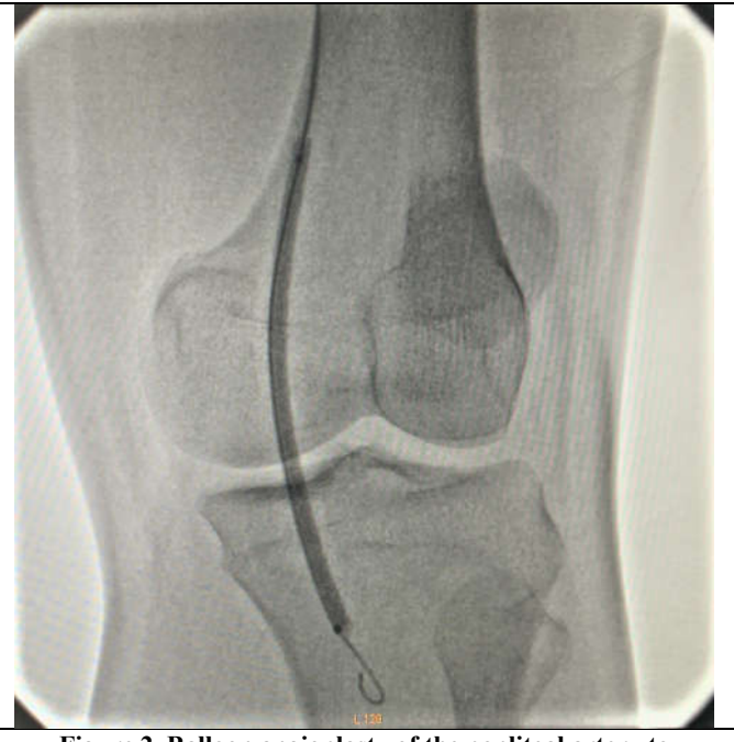
Figure 2. Balloon angioplasty of the popliteal artery to macerate the clot and create a channel