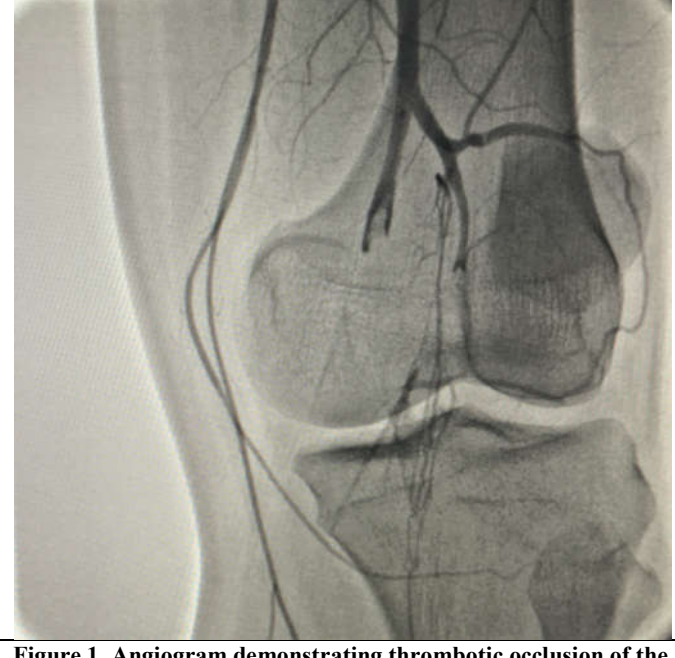
Figure 1. Angiogram demonstrating thrombotic occlusion of the popliteal artery in its proximal course with no flow beyond the site of occlusion