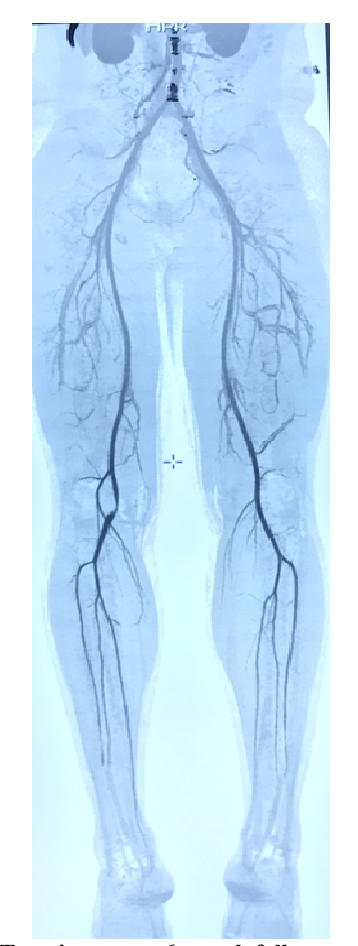
Figure 7: A CT angiogram at 6 month follow up showing good and sustained recanalization.

Patients with class I acute limb ischemia need urgent revascularization (i.e., within 12 hours of presentation), and patients with class II acute limb ischemia need emergent revascularization (i.e., within 2–6 hours of presentation). Patients with irreversible limb ischemia (Rutherford class III) may require amputation without attempted revascularization as reperfusion abruptly releases toxic by-products of ischemic tissue (potassium, myoglobin, and reactive oxygen species) into the systemic circulation.