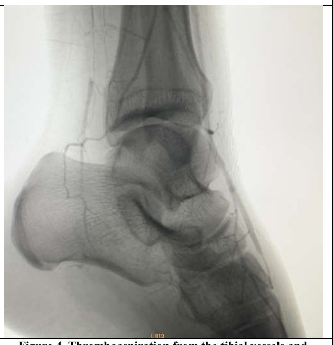
Figure 4. Thromboaspiration from the tibial vessels and dorsalis pedis artery. Arrow indicates the tip of the aspiration catheter