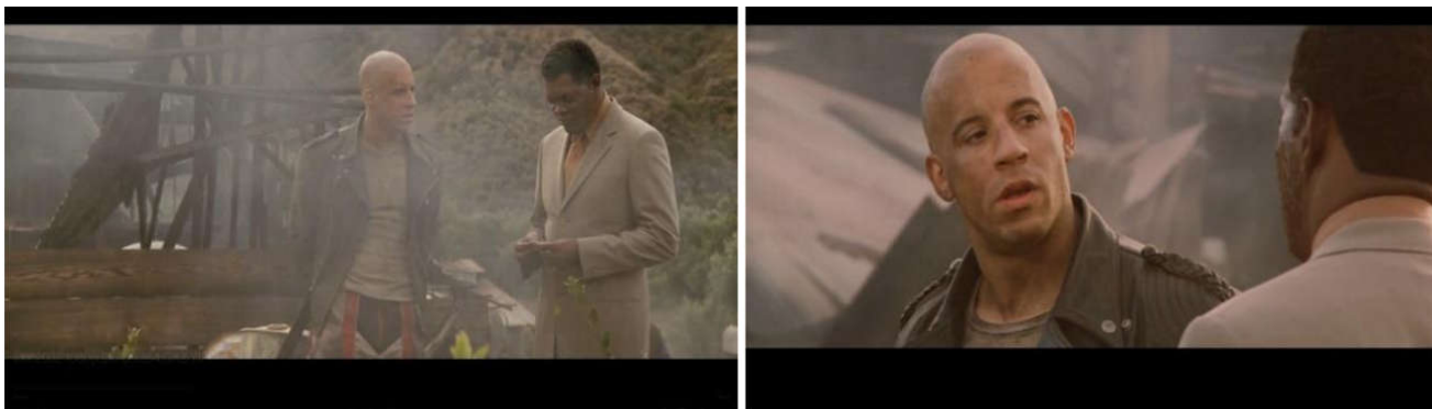
Picture 1. Clips from XXX when Xander Cage getting a new task from Agent Gibbons