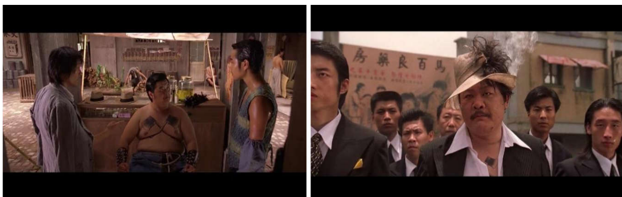
Picture 2. Clips from Kung Fu Hustle (2004) when axe gang come to help