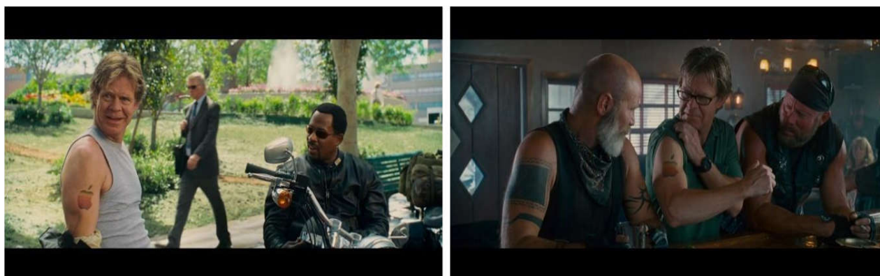
Picture 4. Clips from Wild Hogs (2007) when William H. Macy shows his tattoo and claims that he is a biker.