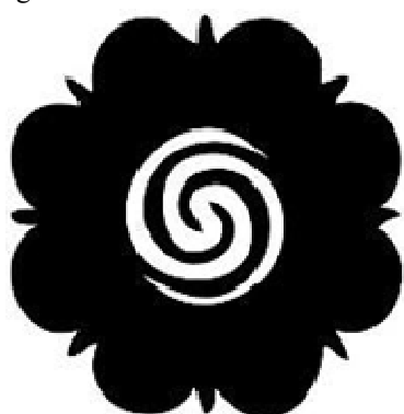
Diagram 4. A common Bunga Terung design

In Kuching Sarawak, the response was good with 60% of people view tattoos in a positive light. To question 1, they have answered that tattoo is not bad. To question 2-5, they have answered yes, showing that they have clear understanding of tribal tattoos, and their difference from gang tattoos. Answering disagree to question 6 & 7 (tattoos are bad when it worn by a convict, tattoos that we know today have significant link with gang/clan), they understand that tattoos act as life stories on one's body, with no other criminal meaning. Because of their exposure to the various forms of tattoos on the bodies of Kuching population, they answered 'agree' to questions 8 & 9 (tattoo is a form of self-expressive art today, tribal tattoos are no longer exclusively a ritual tattoo) signifies their acceptance and understanding that tattoo has become part of everyday, and is not something to be afraid of, but rather something that has become a heritage.