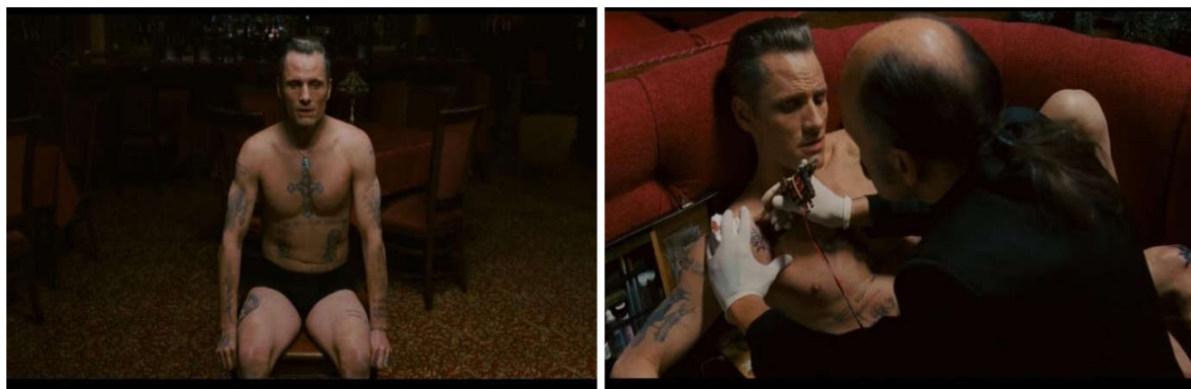
Picture 3. Clips from Eastern Promises (2007) New rank tattoo of a Russian gang