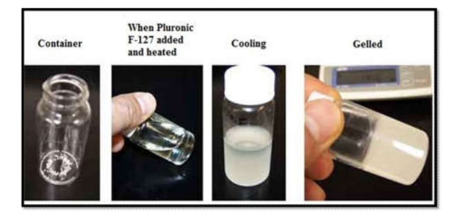
Fig. 1. Preperation and formulation of various types of Organogel

Lecithin Organogels: Lecithin Organogels have emerged as one of the most potential carrier systems. The organogel matrix mainly consists of a surfactant (lecithin) as gelator molecules, a nonpolar organic solvent as external or continuous phase, and a polar agent, usually water. A lecithin organogel is formed. when small amounts of water or other polar substances, such as glycerol, ethylene glycol or formamide, are added to a nonaqueous solution of lecithin. The transfer into jelly-like state has been demonstrated only for non-aqueous solutions of naturally occurring unsaturated lecithin. The latter are mainly separated from soy bean and egg yolk.