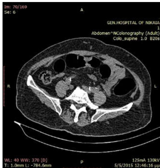
Figure 1 & 2. CT scan depicting colon mass in splenic flexure