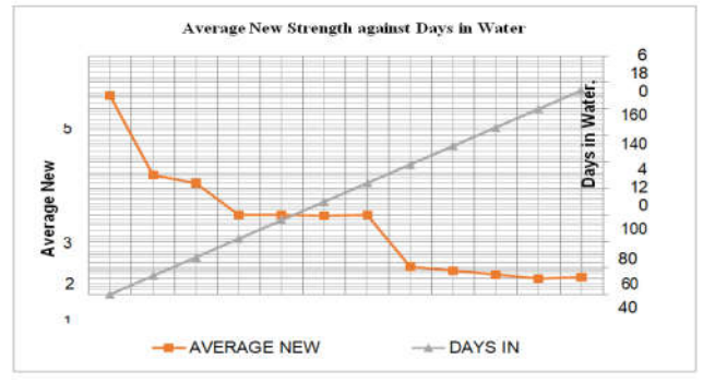
Figure 1. Variation of the average strength with days 1 water

occurred with age of contact. This implies a reduction of the pavement ability to support axle load, as it.