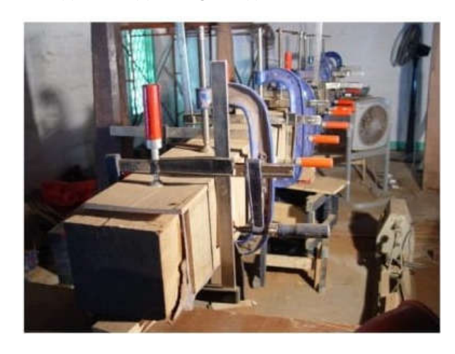
Fig 6. Shown bonding process

Conservation issue: In this mosque the major damage was caused by termite and it was found that termite lives in nests independent of the wood attacked by them, but sometimes may be hidden inside unfrequented areas of the building itself. In the case of Dharumavantha the colony was 85 meter far from the monument. One nest may forage for food 30 meters hidden from light, mostly underground, hidden in structural gaps, settlement cracks, electrical, plumbing, sidings or building shelter tubes made of soil and digested cellulose. These termites are especially attracted cellulose materials<sup>1-2</sup>. In nature, termites function as decomposers that break down dead wood, log or timber. Termites attack wood and manufactured wooden goods as well as paper Drywood and subterranean termites are the most destructive insect pests of wood causing more damage Responsible for most of the damage in Male<sup>3,5-7</sup>. Apart from termite damage, another type of damage was caused by physical forces and pressure on the hollowed components because the termite eaten away all the cellulosic material inside of the wooden beams, painted panels, loads bearing components and rafters. There was left only debris which made all the components widely shrink and This paper will deal with the adhesive and fillers applied in a condition of sea costal areas where this mosque is situated and where relative humidity is almost at saturation point throughout the year.