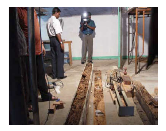
Fig 4. Documentation of Extent of deterioration by termite in beam