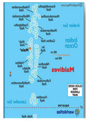
Fig 1. Geographical Location of Maldives