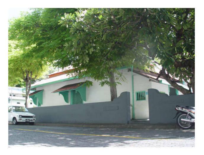
Fig 2. General View of Dharumavantha Rasgefaanu Mosque before conservation