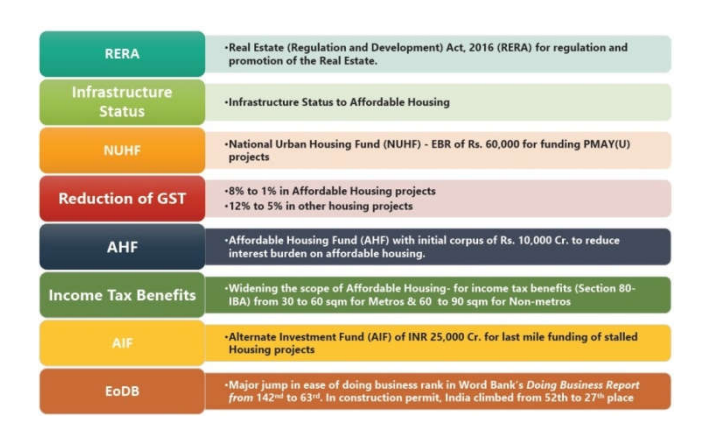
Key Initiatives of Government Driving Progress

FOR ALL': The Government, RBI and National Housing Bank (NHB) play a pivotal role. These bodies are launching initiatives aimed to bridge the gap between the supply and demand to ensure the vision of delivering "Housing for All" by 2022.