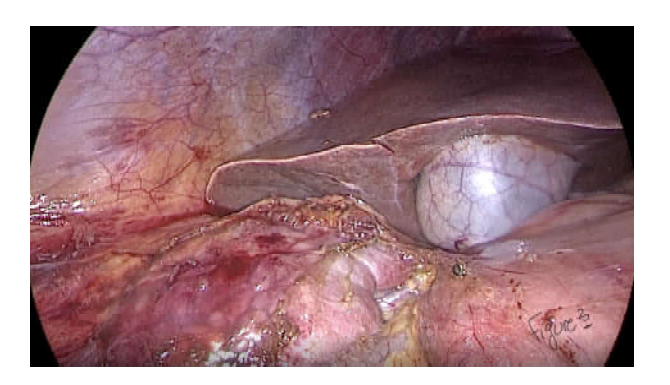
Figure 3. Laparoscopic view shows kocherization of the duodenum

Afterwards, kocherization of the duodenum was performed. (Figure 3) The alimentary limb and biliary limb from the gastrojejunostomy were identified and a side-to-side duodenojejunostomy was created with Endo-GIA stapler TM and the enterotomy was closed and re-enforced with 3-0 V-lock suture TM