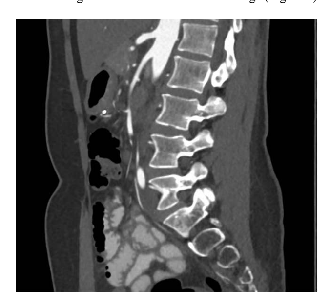
Figure 1. CT scan of the abdomen.

nausea, and vomiting of three years duration. Two years prior to presenting to our hospital, she was diagnosed to have SMA syndrome, and she underwent gastrojejunostomy for treatment. Despite the surgical intervention, her symptoms persisted over the two years. The patient did not have a history of rapid weight loss and did not have any co-morbidity. On physical examination, her BMI was 20.3 and she denied any change in her weight over the previous 2 years. She had abdominal distention with epigastric tenderness on deep palpation, and her hernial orifices were intact. Laboratory investigations of a complete blood count, kidney function, and liver function were all within normal range. CT scan of the abdomen revealed an aortomesenteric angle of 22 and an aortomesenteric distance of 8.5mm in addition to gastrojejunostomy anastomosis opposite the incisura angularis with no evidence of leakage (Figure 1).