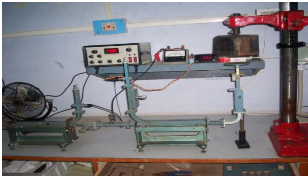
Figure X. Band Experimental set up to measure the Dielectric parameters

\lambda_d = wavelength in the dielectric powder.