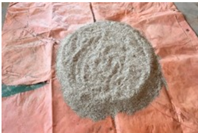
Fig. 2: The particles of the leaves of raffia

Preparation of the African locust been pod tannic powder: The pod of African locust been is also harvested in the central region of Togo. It is dried in an oven at a temperature of 72°C for three days, devoid of any humidity. Then it is transformed into powder in the RETSCH knife mill with a 2 mm diameter sieve. The material resulting from the grinding is sieved successively with a sieve of 1.6 mm and 0.8 mm; Thus, two fibers are obtained; the first with a diameter between 1.6 and 2 mm and the second with a diameter between 0.8 and 1.6 mm to separate the fiber from the husk. The material that has passed through the 0.8 mm sieve is again sieved with a 0.125 mm sieve to have the tannic powder. The figure 3 describe the process of obtention on the tannic powder of African locust been.