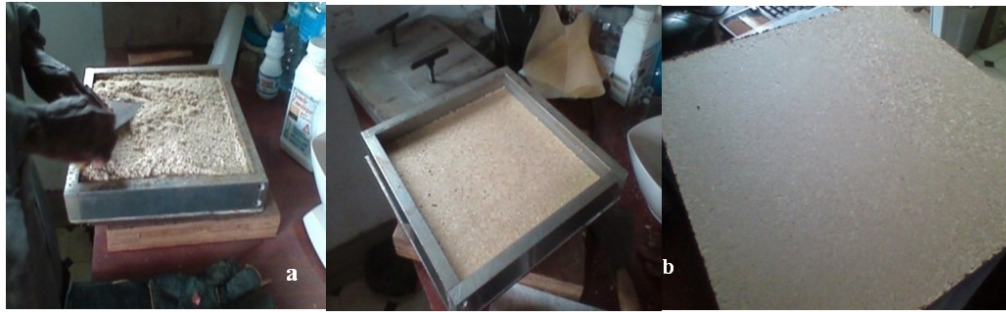
Fig. 4. Particleboard of leaves from raffia branches before (a), and after (b, c) thermal pressing

The rate of thickness swelling : The rate of swelling in thickness is between 43 and 68% after 2 hours and 66 to 73% after 24 hours of immersion.