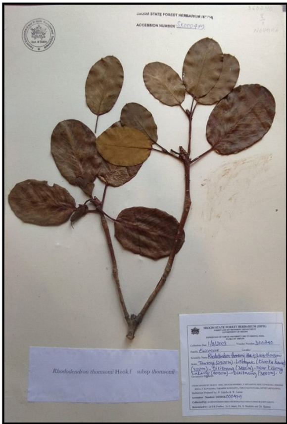
Fig 2. Rhododendron thomsonii Hook.f subsp. thomsonii