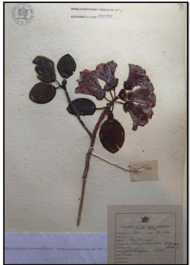
Fig 3: Rhododendron thomsonii Hook.f subsp. yumthangensis ssp. nov.