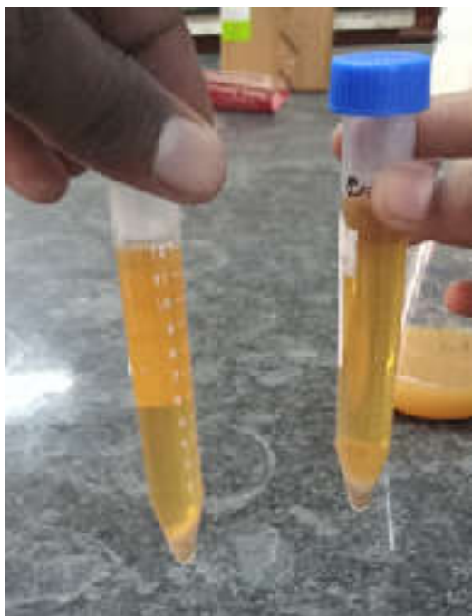
Fig.4 Centrifuged broth containing Azospirillum