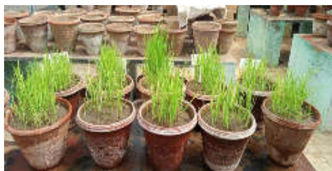
Fig.7. Azospirillum inoculated Rice seedlings under Pot Culture Conditions

POT CULTURE EVALUATION: Pot culture is a method of growing treatments of biofertilizer treated seedlings and observing their root as well as shoot length. This evaluation is performed using rice seedlings.