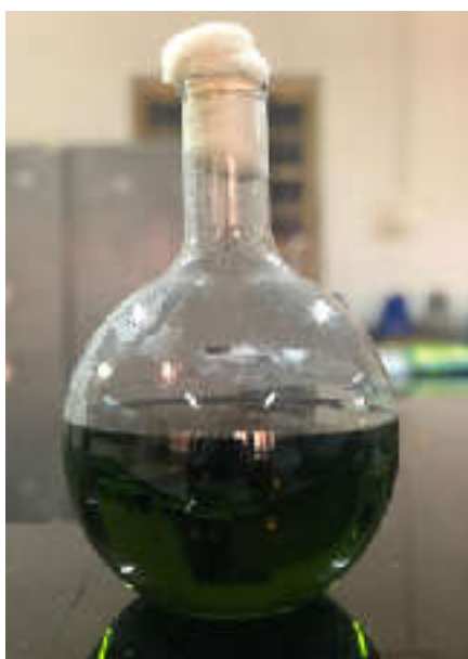
Fig. 3. Glucose peptone broth