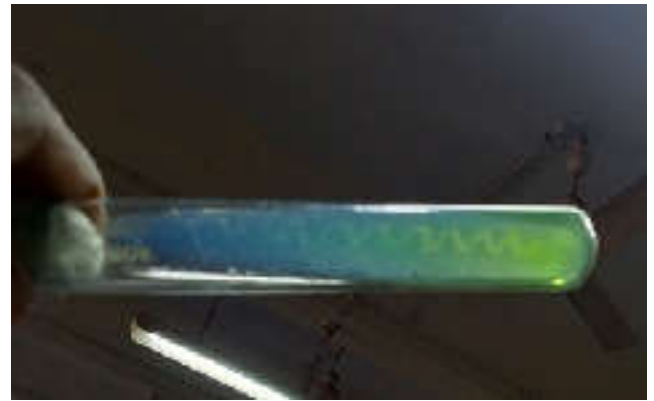
Fig. 2. Azospirillum Slants

Isolation of Azospirillum was made from rhizoplane of Paddy root samples obtained from Agricultural College and Research Institute Campus, Madurai district. Nearly, six Azospirillum isolates were obtained by adopting enrichment culture technique.