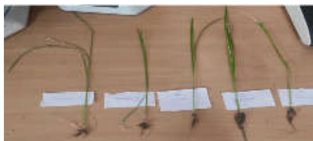
Fig.8 Biometric Observation of Azospirillum treated Rice seedlings

Rice seeds (ADT 45 Variety) were soaked overnight and were sown in pots. As soon as the seedlings start to emerge the Azospirillum was inoculated into these pots. Two controls and three replications/treatments were maintained. Under these two controls, no azospirillum was inoculated. In replications, T1 was inoculated with 50 ml of Azospirillum , T2 with 100 ml and T3 with 150 ml. After few days of their growth, the root as well as shoot lengths were measured which is given below in Table.1