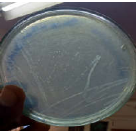
Fig. 1. Isolated plate

The results of the above foresaid experiments like isolation, purification, Biochemical characterization, IAA production are categorized below,