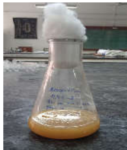
Fig. 3. Glucose peptone broth

IAA PRODUCTION: This study began with the isolation of bacteria type strain Azospirillum sp. and developed the investigation to a screening of their ability in IAA production. This screening conducted a selection of only bacteria that was capable of the production of IAA with its content of over 28 mg mL -1 for sequencing. Various factors that influence Azospirillum sp. in biosynthesizing IAA such as temperature, pH, nitrogen presence and concentration of tryptophan in the culture medium were examined. The results indicated that the culture conditions were suitable for IAA biosynthesis at pH 6.5, 30 °C, culture media with nitrogen, and 0.1% tryptophan.