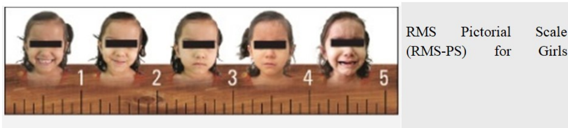
Figure 3. Showing Raghavendra-Madhuri- Sujata Pictorial Scale for Girls (RMS-PS)