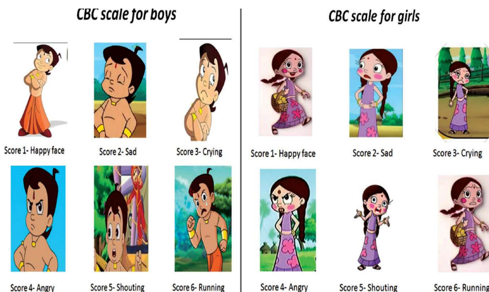
Figure 4. Showing Chota Bheem–Chutki Pictorial Scale (CBC-PS)