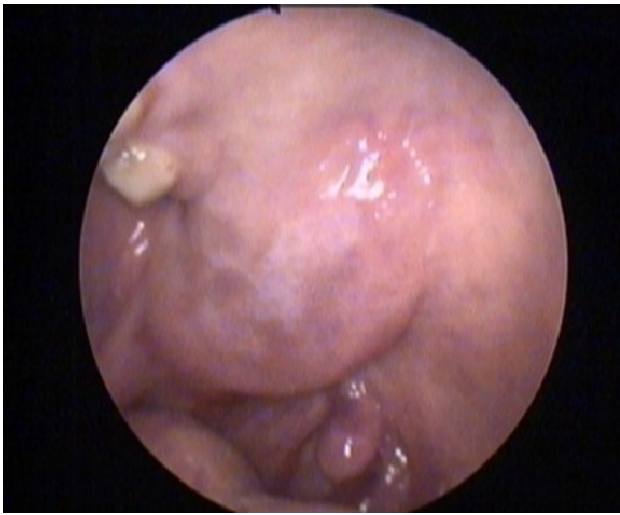
Fig. 1. Showing oval shape swelling on soft palate