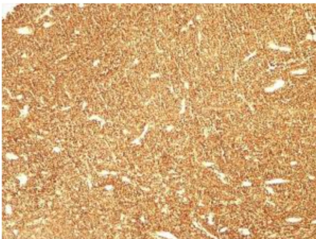
Fig. 3 IHC immunoreactive CD-20 in lesional cells