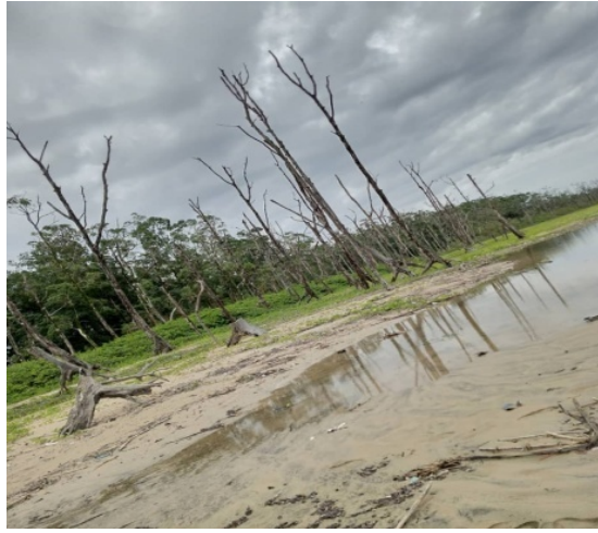
Plate 1. Vegetation loss at Koluama II Community