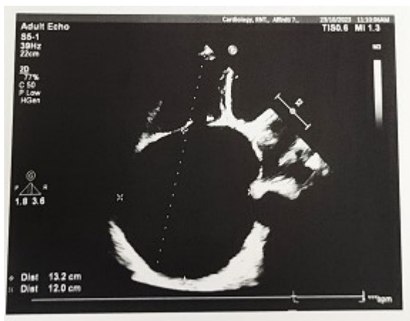
Fig. 2. Echocardiography of Right atrium showing abnormality dilated 13*12 cm size