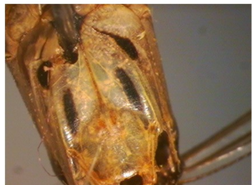
Lestes jerrelli Tennesen, 1997 (Thorax ventral)