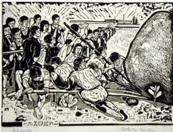
Liu Kang, Woodcut, 1960s

The woodcut movement in Singapore gained momentum in the aftermath of World War II. The socio-economic crisis, nationalist fervour, natural calamities, and the struggle to overcome adversity were depicted in Singapore's post-war woodcuts.