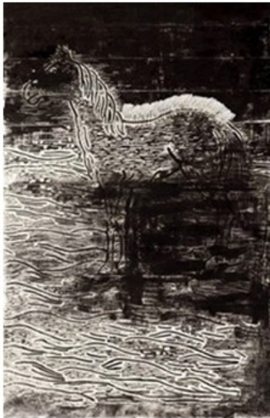
Zhang Huan, 'Tui bei Tu', Woodcut, 2006