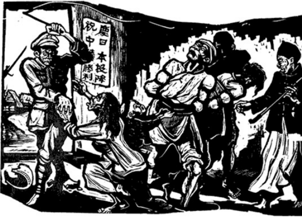
Li Hua, Celebrate the Surrender of Japan and the Victory of China , Woodcut on paper, 1946, 20 X 27 cms

Rong-can responded to the terrible genocide committed by the governor Chen Yi on February 28, 1947 in Taiwan, also marked in history as '228 incident'. In The Horrifying Inspection , the artist attempts to capture a fragment of the '228 incident', portraying the army's brutal killings of innocent civilians in a black and white woodcut. As a means to depict the forcefulness of the moment, Huang rendered the civilians thrust against speedily ripped horizontal lines, enlivening their petrified reaction to the incident. The shadows and highlights are contrasted in wonderful silhouettes against white spaces.