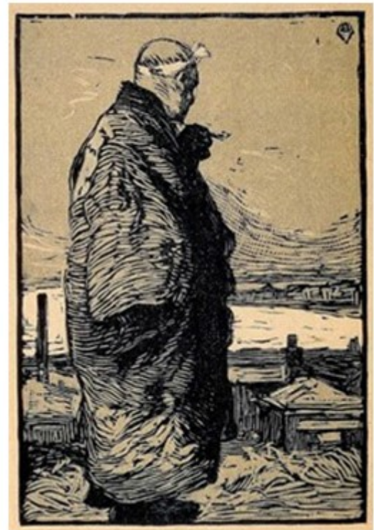
Kanae Yamamoto, Fisherman , Woodcut, 1904

Foreign influences and the advent of the avant-garde in the Far East: In the first quarter of the 20th century, the tradition of Moku-hanga came under threat as Western ideology took hold, leading to the adoption of an 'original print' aesthetic. Prior to the 20 th century, the Moku-hanga was produced following the assembly line method or hanmoto system. But after being exposed to Western influences, Japanese artists developed a concern for self-assertion. Departing from the hanmoto system, artist Kanae Yamamoto (1882-1946) individually executed a small print in black and white, titled 'Fisherman'. As a result, 'self-drawn, self-carved, self-printed' became the ideology of the ' Sōsaku-hanga ' or creative print movement.