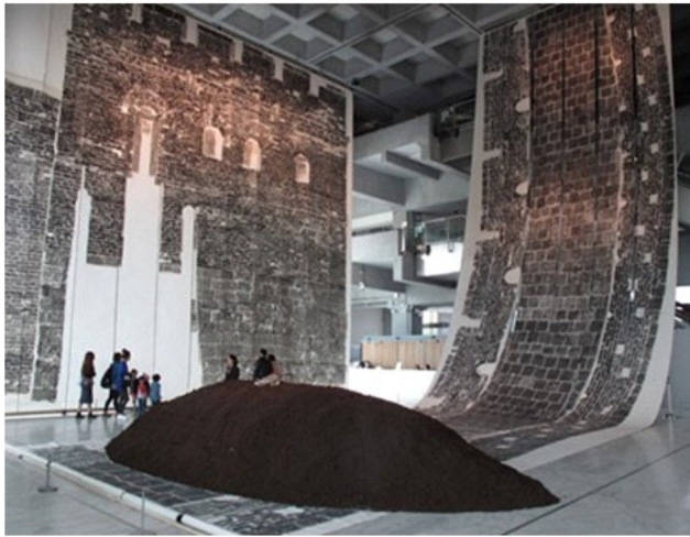
Xu Bing, Ghost Pounding the Wall ink rubbing on paper with stones and soil, 1990-91

His recent large scale monochrome and black and white relief prints represent his continuous association to the waterbody and Arabic geometry.