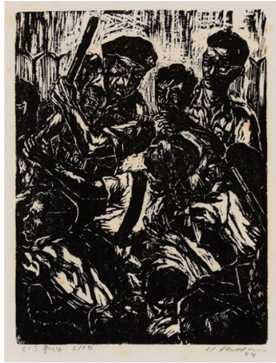
Choo Keng Kwang, Insident 519 , Woodcut, 1954

Liu Kang, for example, delineates people in dynamic action, unblocking a path, while artist Choo Keng Kwang attempts to capture a political scuffle between students and police in a black and white woodcut. With the advent of the New Woodcut Movement in Japan and China, the art of relief printmaking, or more accurately, the art of black and white relief printmaking, was reborn in the Far East. Perhaps the rationale for black and white execution was that it was relatively inexpensive, immediately reproducible, and, above all, was its stark simplicity in conveying the day to day travails of the common people. Contemporary Chinese printmaker Chen Qi re-contextualised this socialist philosophy in the light of more recent global crises such as the politics of ecology. "Chen is not simply restating those visualisations. Rather, he articulates a nuanced reference to the socialist period with cognisance of how it is understood today." [1] To justify his concern for ecology, Chen eliminated the oil-based Western method of printing, in favour of the Chinese traditional water-based ink or non-toxic approach. On the other hand, he questioned the value of mass-producing relief prints in this digital age, preferring instead to create unique-edition relief prints.