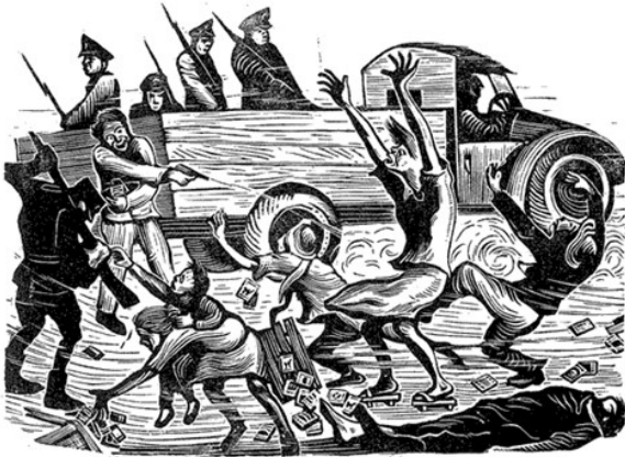
Huang Rong-can, The Horrifying Inspection , Woodcut, 1947

Rong-can responded to the terrible genocide committed by the governor Chen Yi on February 28, 1947 in Taiwan, also marked in history as '228 incident'. In The Horrifying Inspection , the artist attempts to capture a fragment of the '228 incident', portraying the army's brutal killings of innocent civilians in a black and white woodcut. As a means to depict the forcefulness of the moment, Huang rendered the civilians thrust against speedily ripped horizontal lines, enlivening their petrified reaction to the incident. The shadows and highlights are contrasted in wonderful silhouettes against white spaces.