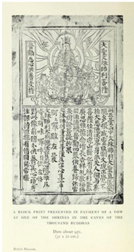
Woodblock print from the Cave of the Thousand Buddhas, Tang Dynasty, China, C.950 AD