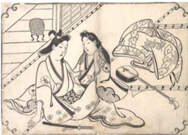
Hishikawa Moronobu, Two Lovers , Woodblock print on paper, 1664, 22.9 x 33.7 cms

The book contains some charming black and white prints of birds and Japanese heroes, engraved in linear lines often accompanying flat silhouettes. With the advent of printed pictures, the demand for Yehon among the merchant classes of Osaka and Edo grew considerably in the final quarter of the 17th century. As a result, a paradigm shift from books to single-sheet woodcut prints occurred. Single-sheet compositions were printed in black outlines. To make them more enticing, the blank space came to be filled in with hand-tinting. Colour printing was invented soon after.