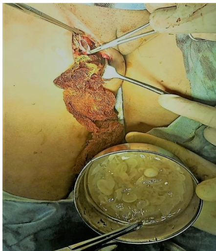
Fig 3. Intraoperative view, showing hydatid cyst thigh with daughter cysts