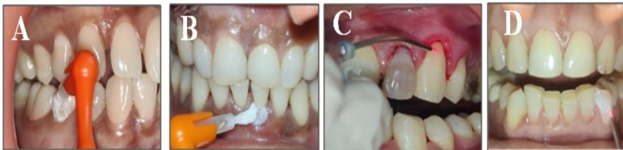
Figure 1. Hypersensitive sites treated with different treatment modalities. A. Control sites treated with placebo dentifrice using an applicator tip (group I); B. sites treated with SHY-NM dentifrice (group II); C. sites treated with Diode laser (980 nm) at 0.5W in non contact mode (group III) and D. sites combinedly treated with SHY-NM dentifrice followed by Diode laser (group IV)

ns: not significant, *: significant, **: highly significant