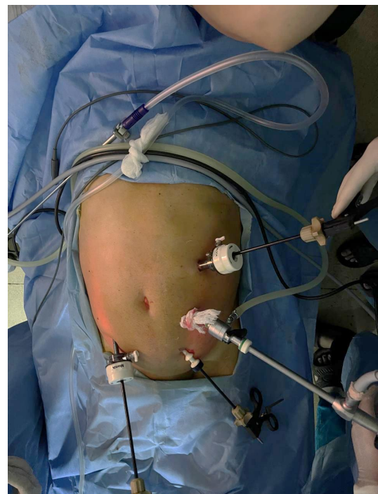
Image 2. Port Placement for right Hemicolectomy