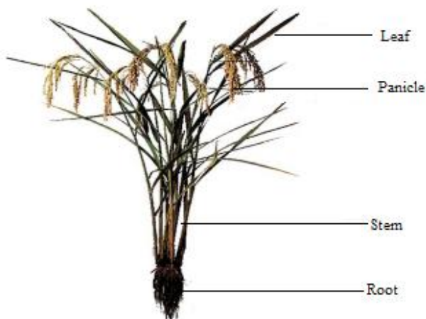
Fig. 2. Rice plant with various parts (Lacharme, 2001, modified)

The data do not follow a normal distribution; the Shapiro non parametric test was used. To study the probable links between the different variables, the Spearman r correlation test was made. P values were determined, if P \leq 0.05 ; the difference is significant.