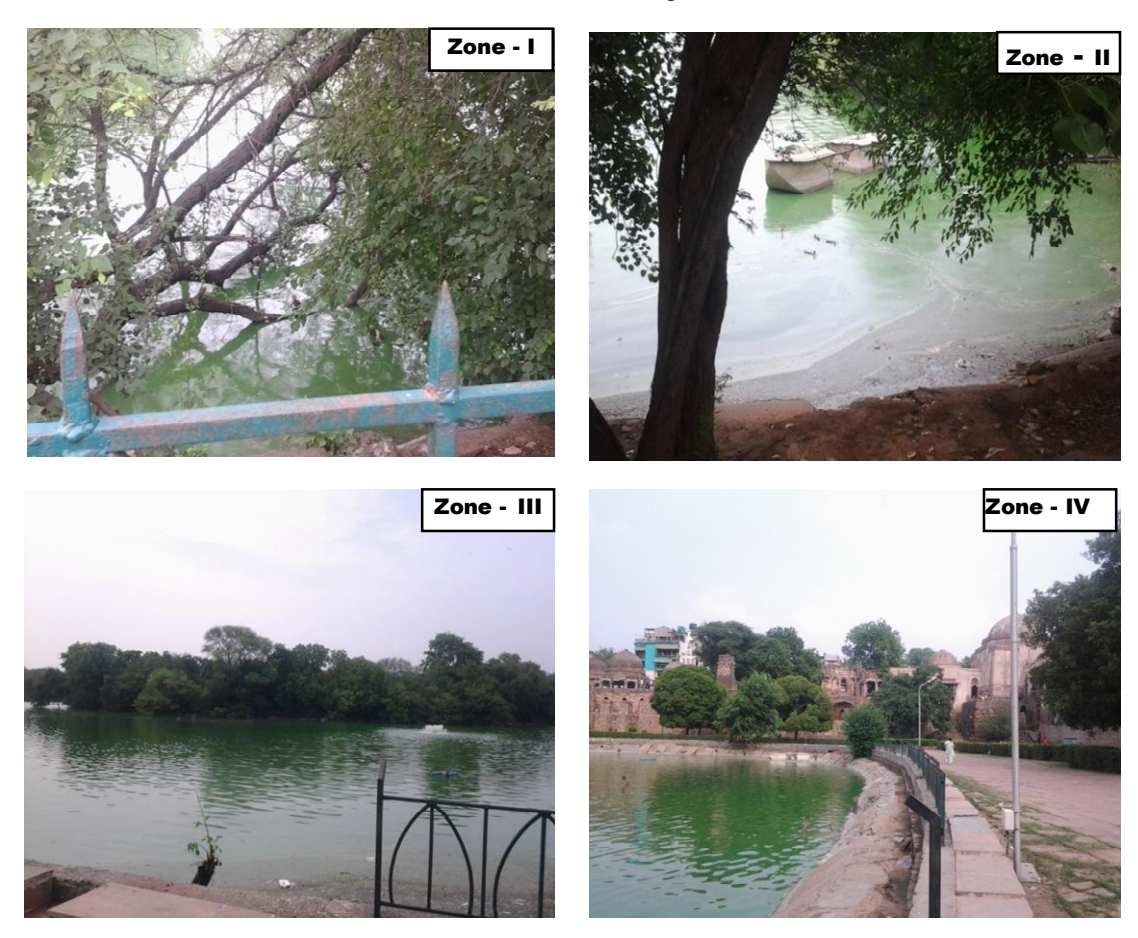
Fig 2. Sampling points of Lake

As it is a well-known fact that the sources of usable water on the earth are limited, any kind of pollution in them will further reduce its availability. Polluted water cannot be utilized for drinking because of its inherent health risk.