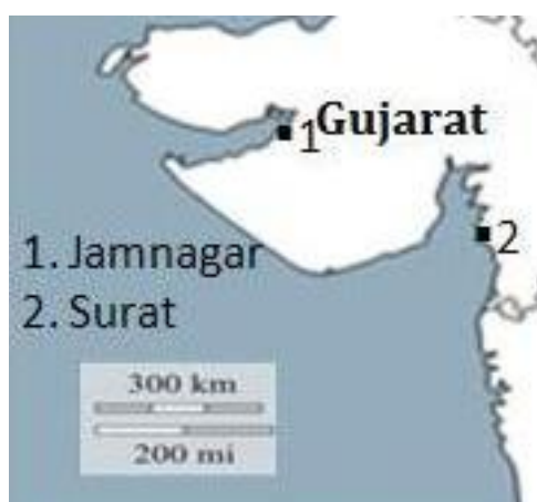
Fig. 1. Map showing collection sites along the West Coast of Gujarat, India

At pH 9.5 JAMNF5 documented maximum percent weight loss (1.56±0.56%) whereas minimum percent weight loss (0.64±0.22 %) was recorded with the isolate SURF1 (Fig. 3). Maximum percent weight gain (24.41±6.99 %) was reported with JAMNF4 followed by least percent weight gain (0.66±0.18 %) by the isolate SURF4.