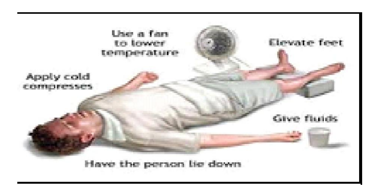
Fig.1. First aid for heatstroke

If you suspect that someone has a heatstroke, call 108 immediately or bring the person to a hospital. Any delay in seeking medical help can be fatal. While waiting for the paramedics to arrive, initiate first aid. Move the person to an air-conditioned environment - or at least a cool, shady area - and remove any unnecessary clothing. Fan air over the patient while wetting his or her skin with water from a sponge. Apply ice packs to the patient's armpits, groin, neck and back. Because these areas are rich with blood vessels close to the skin, cooling them may reduce body temperature. Immerse the patient in a shower or tub of cool water, or an ice bath (Bouchama et al. , 2007)