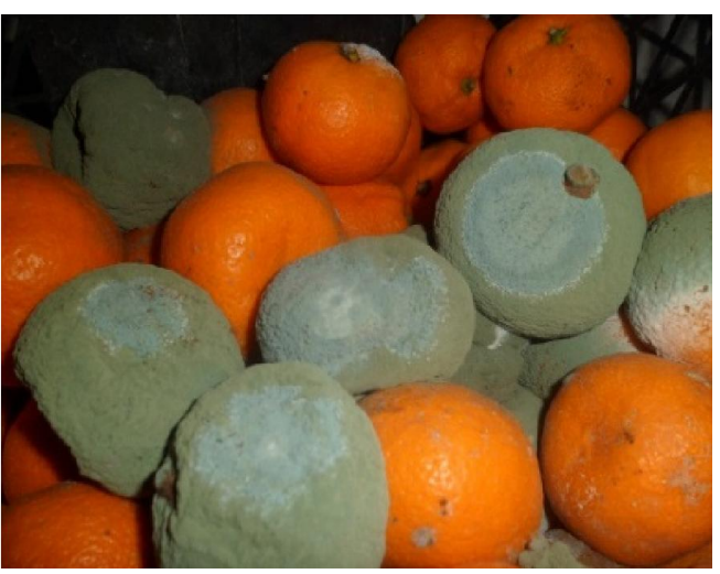
Figure 8. Citrus Gray Mold on the fruitFigure. 9 Citrus Green Mold on the fruits

Citrus Green Mold (causal agent -PenizilliumitalicumWehm), infects citrus fruits while storage. Sometimes 15-30% of fruits are killed because of this disease. The infected place becomes watery soft, the spot becomes bigger and after a couple of days a white mycelium is developed on the fruit on which a flake appears. It becomes bigger and covers the surface of the fruit. The infection develops very quickly and spreads on the other fruits. Mechanical damage, humidity, high temperature is a favorable condition for this disease.