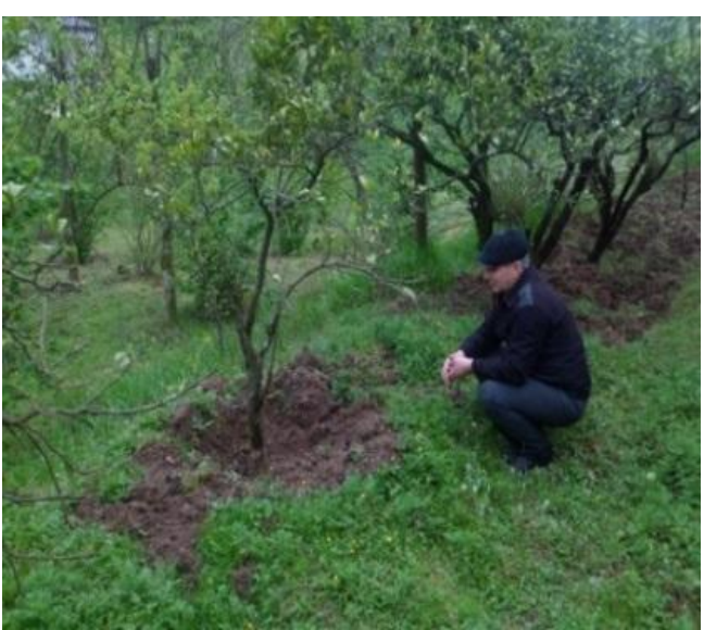
Figure 2. Citrus tree with Phytophthora root rot

Citrus Anthracnose (causal agent-Collect otrichum glocosporioides (Penz), infects citrus mature leaves, flowers, ovaries, green and ripe fruits. The spot on leaves is of light green color in the beginning, later, it becomes grey. Under wet conditions, red blotches appear on the spot, which are fungus spores. If the disease is severe, the leaves are totally ruined. Every year flowers disease is 20-30%. Green fruits are infected on petioles. Fruits become brown and red blotches appear on the surface. On ripe fruits, dark brown spots appear.