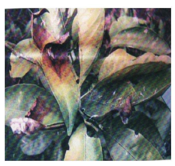
Figure 3. Citrus Anthracnose on the leaves

Citrus Alternaria Brown spot (causal agent- Alternaria citri Piez). The disease is spread in all citrus production regions; causes great crop loss. Infection begins in field conditions and becomes stronger while storage. Green fruits are diseased as well as ripe ones. Near the fruit petioles, brown or dark brown spot appears ( Dewdney and Timmer, 2014 ). The spot spreads alongside the fruit's length towards the centre, then, the mild part of the fruit rots, and the color of rotten fruit changes. It spreads onto other fruits when being in contact with them.