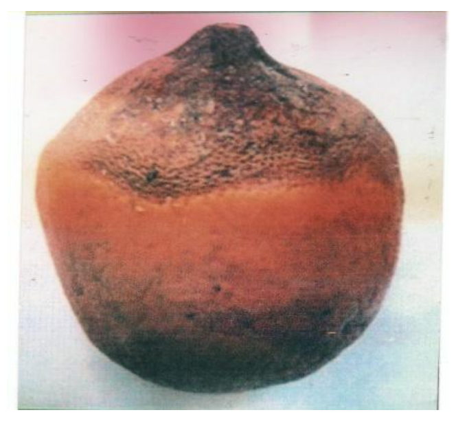
Figure 5. Citrus Alternaria Brown spot on the fruit