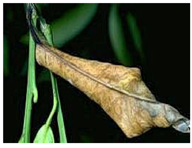
Figure 11. Symptoms of Citrus Blast

It should be mentioned here that in the beginning the disease is fixed on separate leaves and one year old branches ( Snowden , 1990). Necrosis begins from petioles as a small watery, green