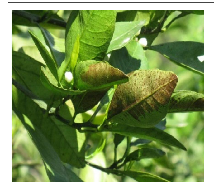
Figure 6. Citrus leaveswithsymptoms of GreasySpot

Citrus Melanose (causal agent - Diaporte citri F.A. Wolf, phomopsis citri H. Fawc), causes citrus black spots, melanose. Young leaves, buds, fruits are diseased in vegetation period. Dark green, thin spots appear on infected leaves; later on they become bigger and of a dark color. When the disease is severe, the leaves change their shape and falls down off the tree. On diseased leaves the fungus develop picnidiums (Nelson, 2008). On green buds, the disease appears as convex dots which unite and form a big dry spot. Then, long thin cracks appear on the stem. The fruit disease begins from the petioles. Different size of black dots appear on green fruits. As the fruit becomes bigger, the spots crack and white dents appear between them. Sometimes, the whole fruit becomes black. In case if the disease is not severe, fruits finish their development, ripe but they rot while storage.