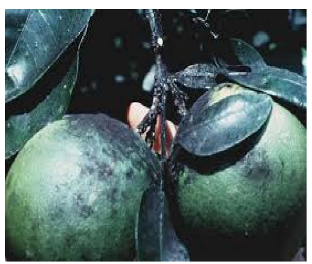
Figure 4. Citrus Sooty mould on the leaves and fruits