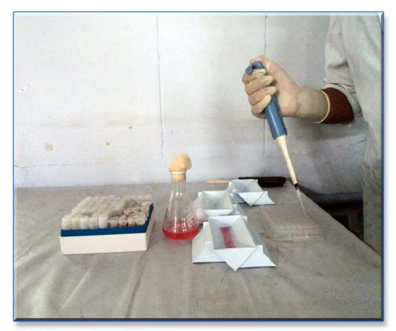
Plate 3a Conduct of HI test