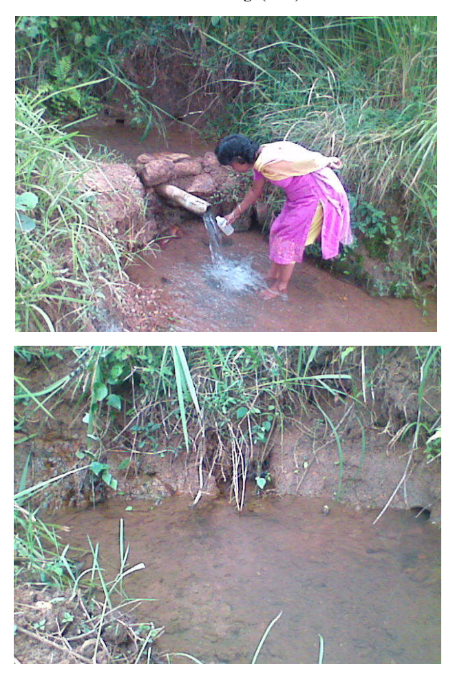
Spring sources in Chowdupalli and Chinakothuru