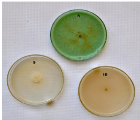
Figure 1. Effect of fungicides on linear growth of Rhizoctonia solani

[1]. Tricyclazole 75%WP (0.1%) [2]. Pripiconazole 25%EC (0.1) [3]. Thiophanate Methyl 70% (0.1) [4]. Mancozeb 75%WP (0.2) [5]. Difenoconazole 25%EC (0.1%) [6]. Hexaconazole 5% SC (0.1%) [7]. Control (untreated) [8]. Copper oxychloride 50%WP (0.2%) [9]. Carbendazim 50% WP (0.1%) [10]. Ridomil 72%WP (0.2)