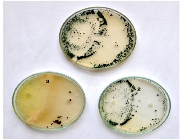
Figure 3. Effect of Bio-control Agents on the growth of Rhizoctonia solani using dual culture technique after 15 days

[1]. Propiconazole 25%EC (0.1%) [2]. Thiophanate methyl [3]. Ridomil 72%WP (0.2) [4]. Mancozeb 75%WP (0.2) [5]. Hexaconazole 5% SC (0.1%) [6]. Tricyclazole 75%WP (0.1%) [7]. Difenoconazole 25%EC (0.1%) [8]. Carbendazim 50% WP (0.1%) [9]. Copper Oxychloride 50%WP (0.2%) [10]. Control (Untreated)