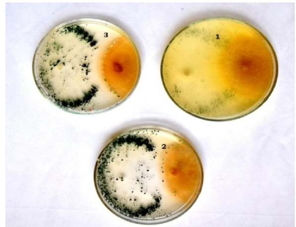
Figure 4. Effect of Bio-Control Agents on the growth of Sclerotium oryzae using dual culture technique after 15 days

1. Trichoderma harzianum 2. Trichoderma hamatum 3. Trichoderma viride