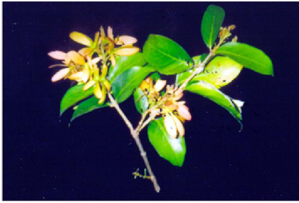
Hiptage benghalensis (L.) Kurz.