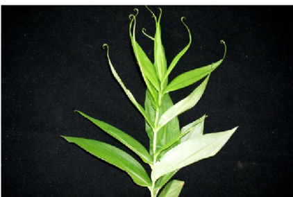
Gloriosa superba L.