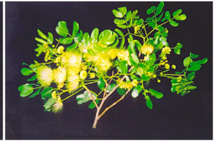
Albizzia lebbek Benth.