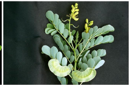
Cassia obtusa (Roxb.) Wight & Arn.