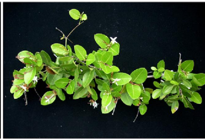
Carissa carandus L.