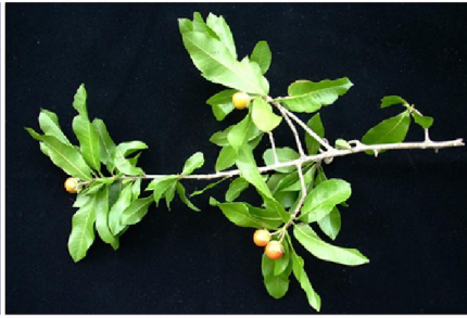
Hugonia mystax L.