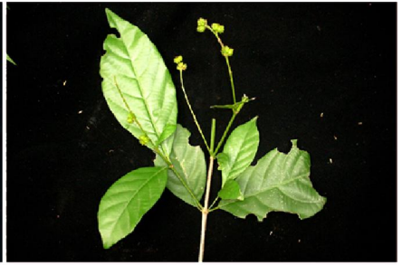
Mallotus philippensis (Lamk.) M.