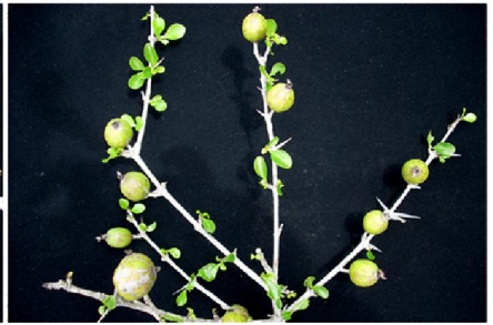
Randia dumetorum (Retz.) Poir.