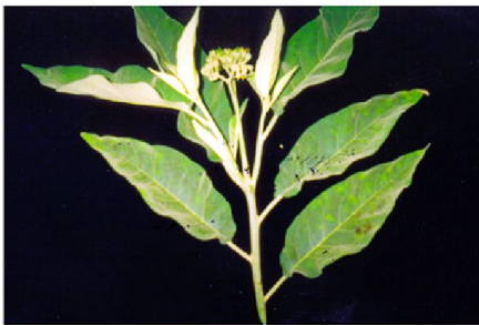
Solanum erianthum L.