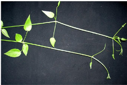
Rubia cardifolia L.