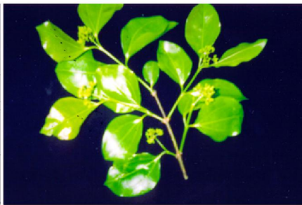
Strychnos nux-vomica L.