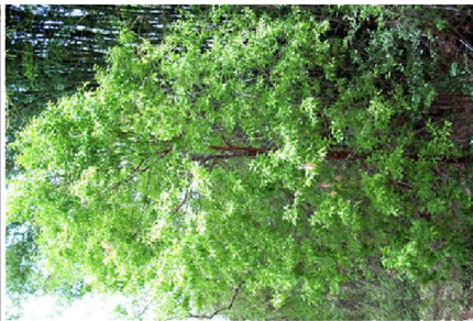
Santalum album L.