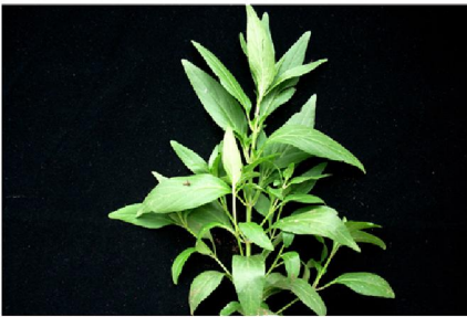
Andrographis paniculata Nees.