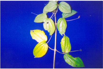
Naravelia zeylanica (L.) DC.