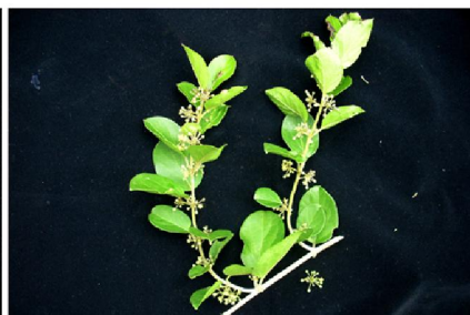
Gymnema sylvestre (Retz.) R.Br.