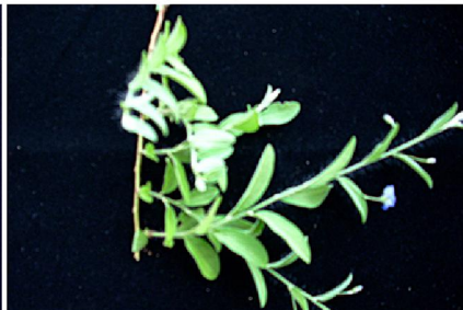
Evolvulus alsinoides L.