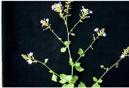
Plumbago zeylanica L.