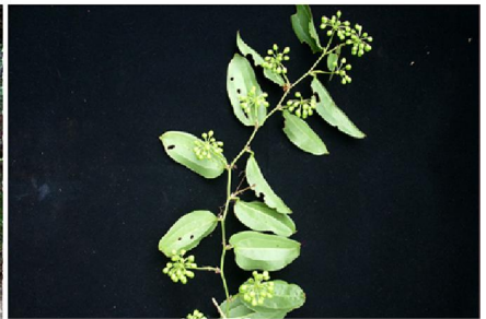
Smilax zeylanica L.