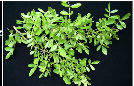
Feronia limonia L.