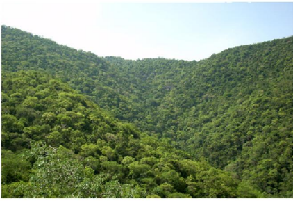
A view of Pachamalai Hills