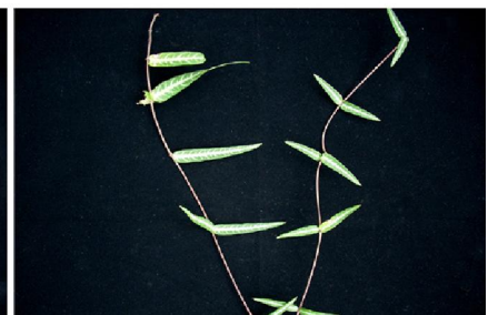
Hemidesmus indicus R.Br.